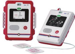
AED 除颤仪 (选配)