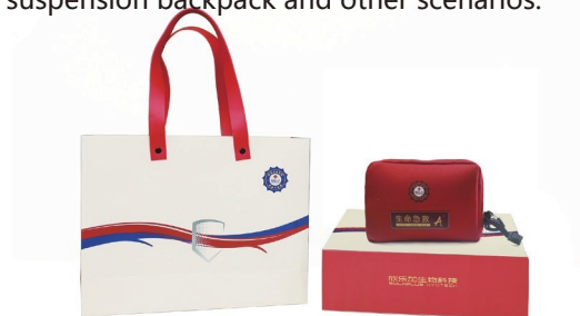
包装 2 （Package2）：礼品装 Gift outfit