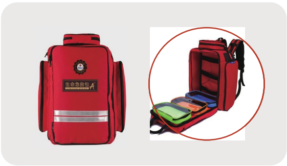
综合急救背囊 -M Comprehensive First Aid Backpack - M