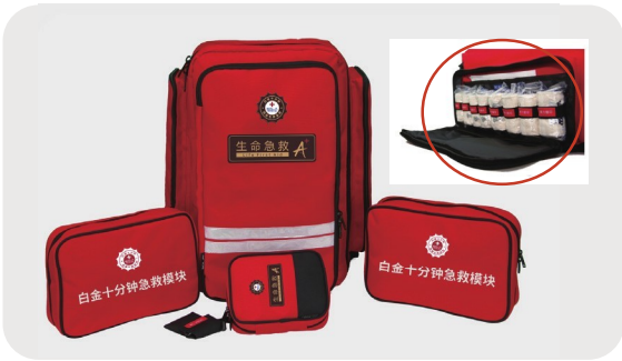
综合急救背囊 -L Comprehensive First Aid Backpack - L