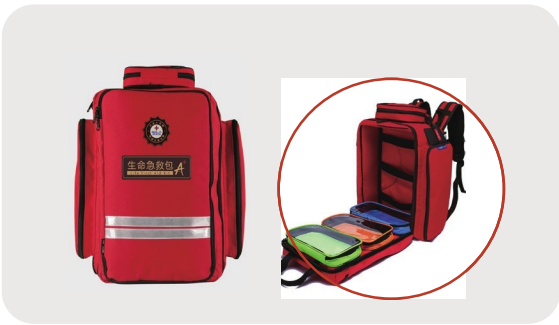
综合急救背囊 -M Comprehensive First Aid Backpack - M